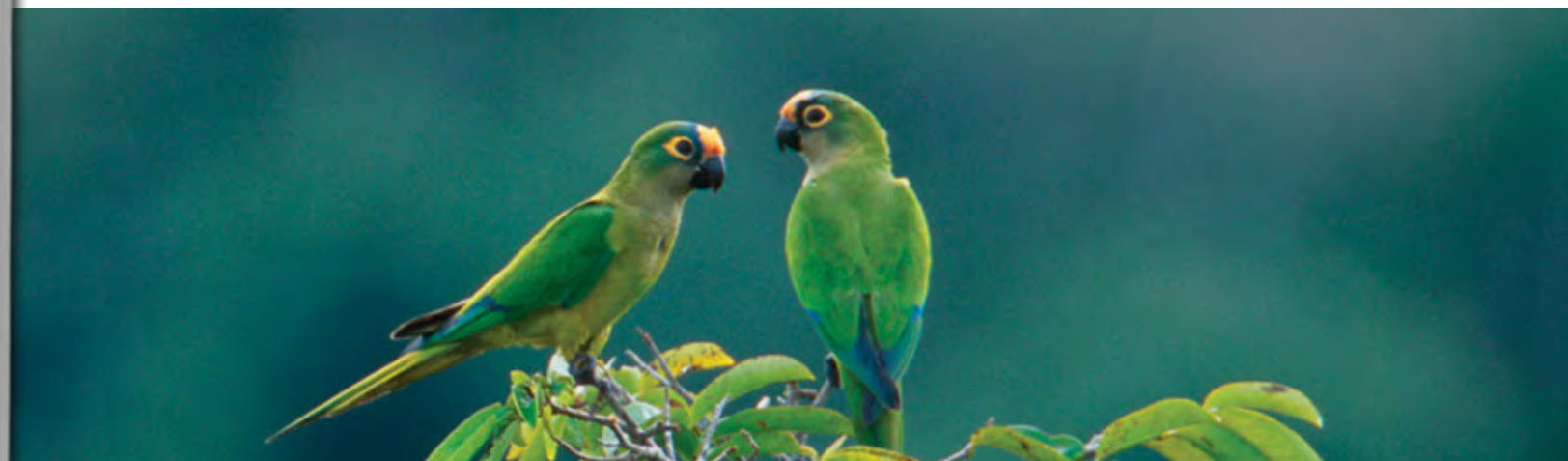
A pair of Orange-fronted Parakeets, Eupsittula canicularis, perch atop a tree.

"My travels to the pristine rainforests deep inside the Amazon River Basin in the 1970s gave me a glimpse into what my native continent of North America must have been like before the arrival of European explorers in the fifteenth century... In another moment of insight in my career as a naturalist, I visited the old-growth hardwood forests of the Congaree River floodplain, in South Carolina, in the early 1970s, when its ownership was still in private hands.