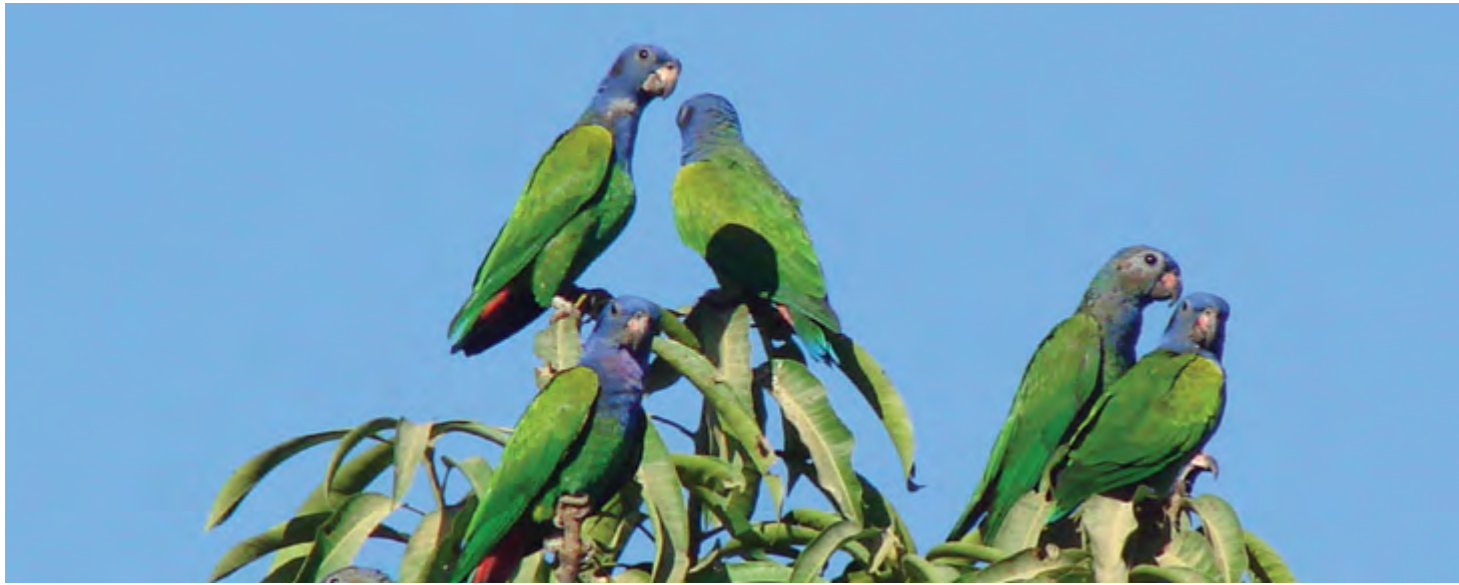
A small flock of Blue-headed Parrots ( Pionus menstruus ) in southern Pará, Brazil.

Parrots and humans (and other primates, and cetaceans, corvids, and elephants) are social and intelligent because the resources on which they depend are locally abundant but scarce and unpredictable on larger spatial and temporal scales. Harvesting such resources efficiently is aided by a good memory, flexible social interactions, and perhaps the sharing of information about resources. Corollaries to sociality and dependence on learning are long lives and infrequent reproduction. In this way, a few offspring can be carefully attended so that they acquire sufficient skills and knowledge before they become independent.